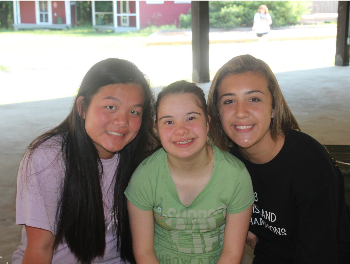
Bridge Camp at the Episcopal Conference Center serves people with special needs.

Give online at episcopalri.org/charities