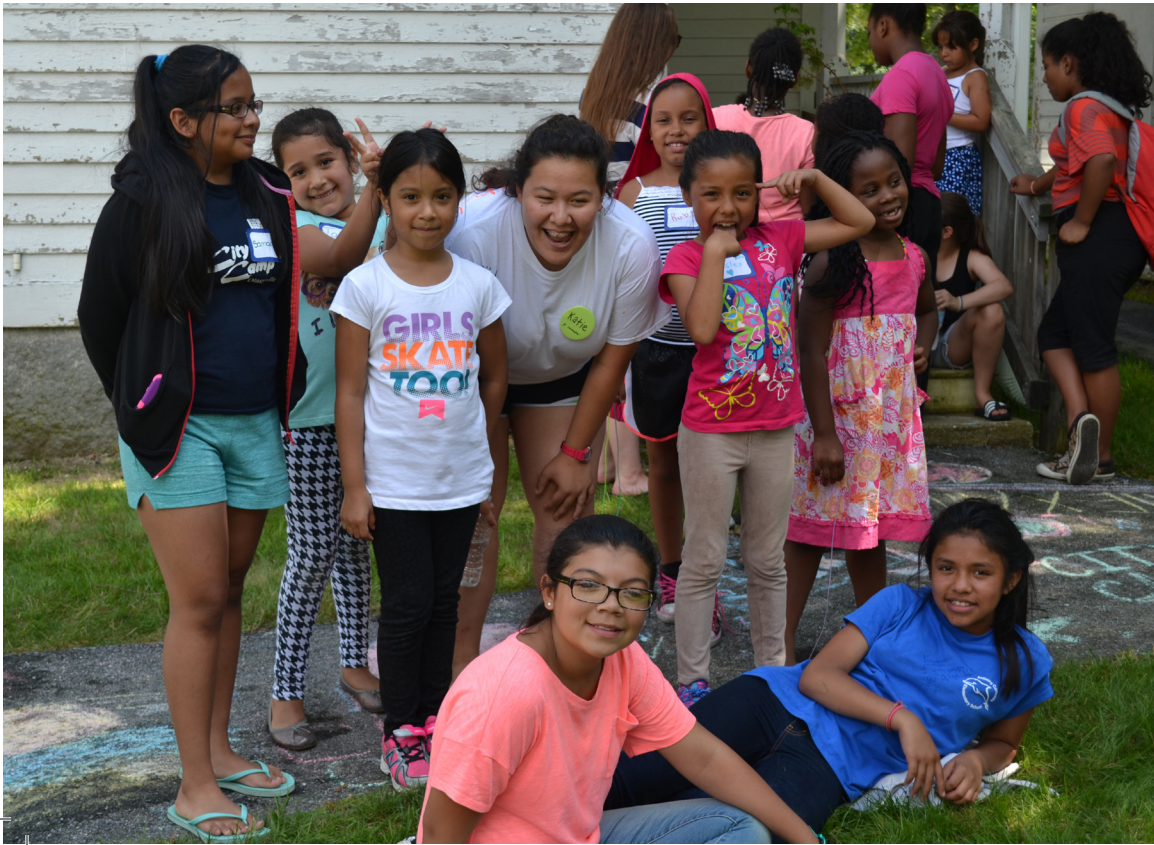
City Camp serves low-income families in Olneyville.

The Episcopal Charities Fund of Rhode Island 275 North Main Street Providence, RI 02903